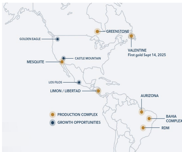
Figure 1. Company Assets as at Dec 2025.

Equinox Gold is principally engaged in the operation, exploration and development of mineral properties, with a focus on gold. The Company's operating gold mines at December 31, 2025 are the Greenstone Mine and Valentine Mine in Canada, the Mesquite Mine in the United States, La Libertad Complex and El Limon Mine Complex in Nicaragua, and the Aurizona Mine, RDM Mine and Bahia Complex (comprising the Santa Luz and Fazenda