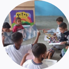
Barrocas (BA) Reading activity